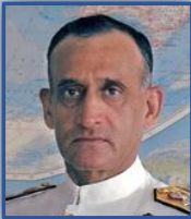
Admiral Arun Prakash (Retd.), PVSM, AVSM, VrC, Former CNS Distinguished Fellow Defence Strategy