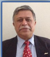
Commodore Lalit Kapur (Retd.)