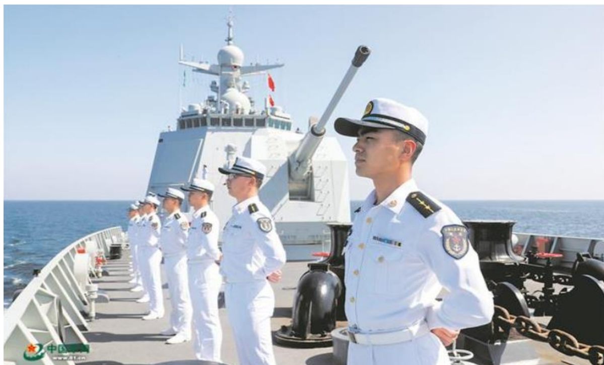
Chinese People's Liberation Army (PLA) Navy participates in the Multinational Exercise 'AMAN-2021' hosted by Pakistan, February 12, 2021.

The navies of China, Russia and six other regional countries participated in the multinational AMAN 21 maritime exercise conducted by the Pakistan Navy. 12 The exercise was aimed at enhancing professional communication and friendly interaction among the participating navies. The Chinese media observed that the PLA Navy's presence in the Indian Ocean region is an important element in maintaining the regional balance of power and promoting maritime security. 13