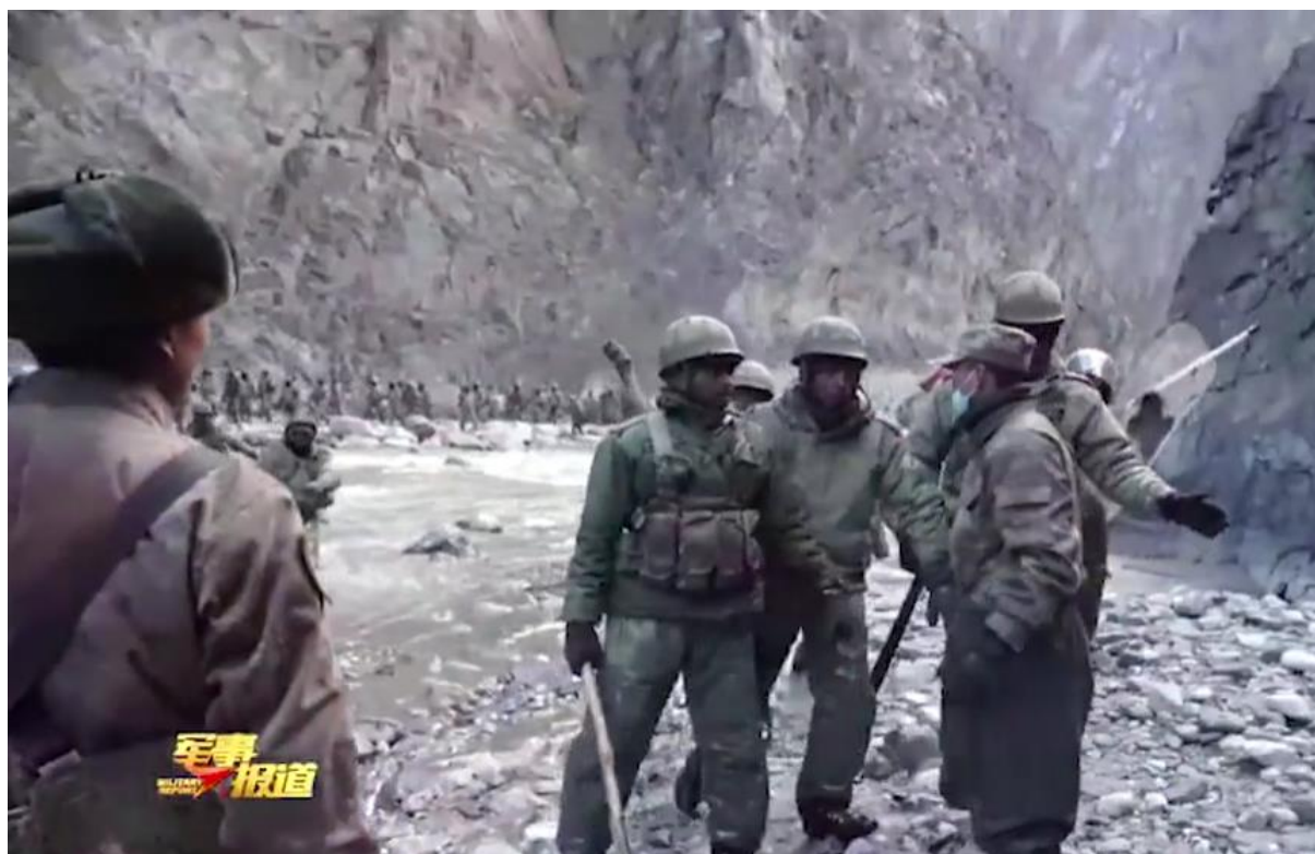
An excerpt from the video released by People's Liberation Army (PLA) paying tribute to four PLA martyrs in Galwan Valley clash with India, February 19, 2021.

demonstrates China's resolution to safeguard the stability of bilateral relations and the determination to not hype hatred or incite nationalism like Indian politicians and media".