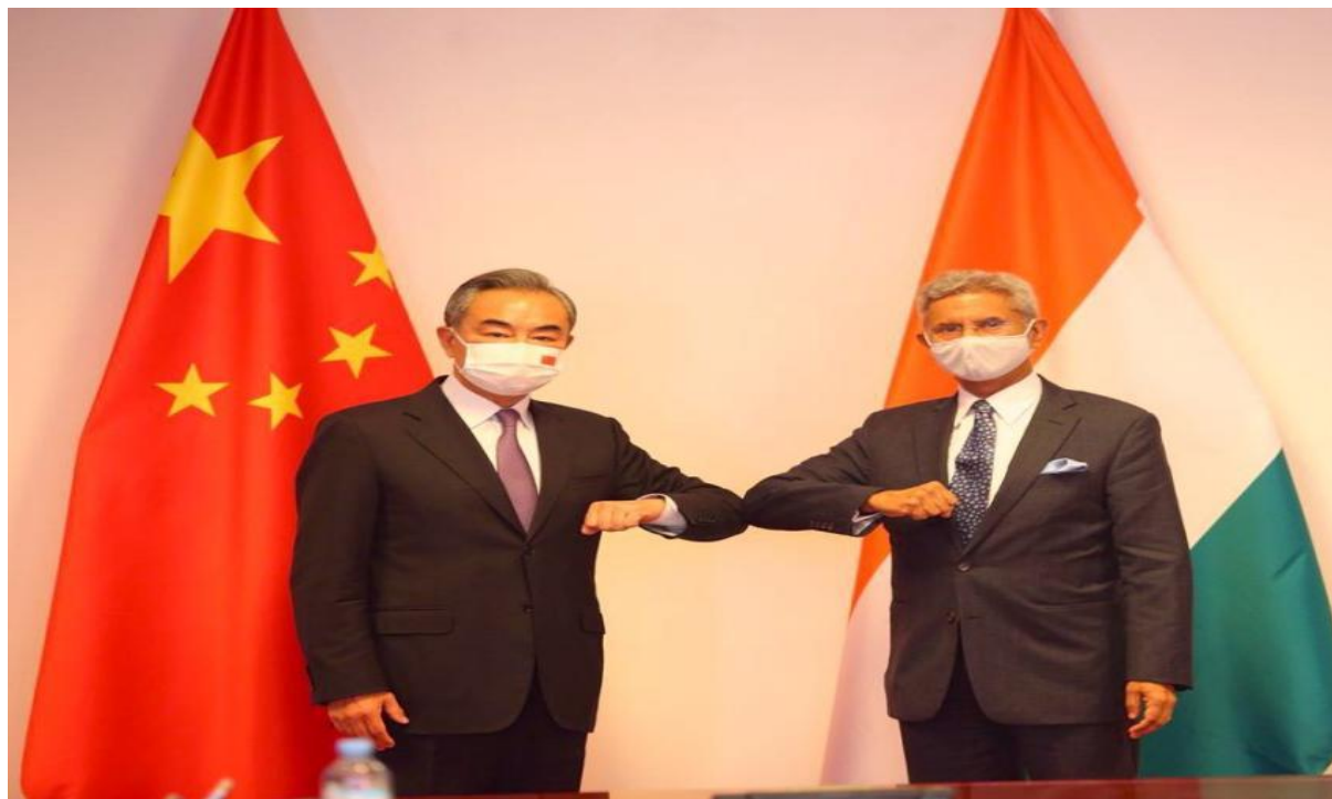
Indian External Affairs Minister Dr. S. Jaishankar meets Chinese State Councilor and Foreign Minister Wang Yi on the sidelines of Dushanbe SCO Foreign Ministers Meeting, July 14, 2021.

Kashgar and Hogan to provide greater flexibility to its air combat operations. 6 In another provocation, the Chinese reportedly erected tents on the Indian side of the Charding Nala in Demchok in eastern Ladakh. 7 These Chinese activities indicate that despite commitments to maintain stability and prevent escalation, during bilateral discussions, its unilateral assertions and provocative activities continue all along the LAC.