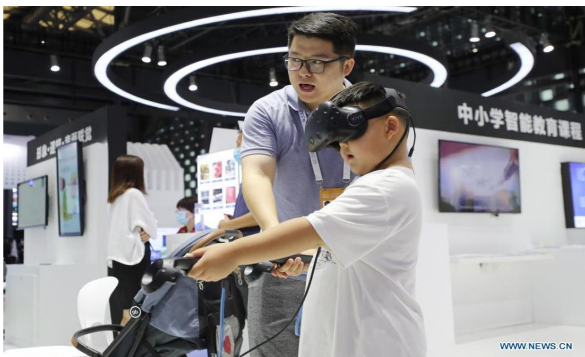
Virtual Reality (VR) device on display at the World Artificial Intelligence Conference (WAIC) 2021 held in Shanghai, July 8, 2021.

Chinese semiconductor output hit a record high in June. 149 The country’s “chip output surpassed 30 billion units in June, a 44 percent increase over the previous year”. 150 Despite the increase, “domestic production remains insufficient to meet local semiconductor demand”. 151 In the first six months of 2021, “China imported more than 310 billion semiconductor devices, a 29 percent increase from the same period in 2020”. 152 Increasing foreign dependency highlights the importance of President Xi’s semiconductor self-sufficiency drive. Beijing continues to urge the country’s technology firms to “ seize overseas opportunities in digital infrastructure ”. 153