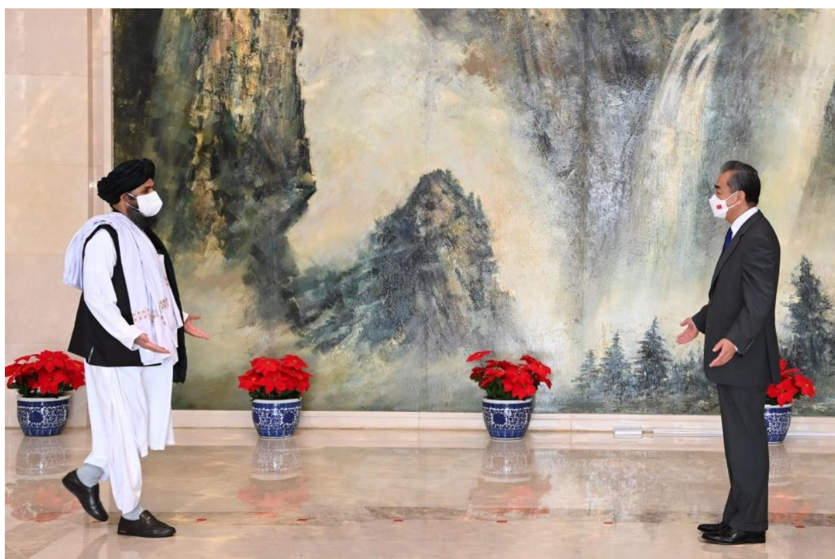
Chinese State Councilor and Foreign Minister Wang Yi meets Taliban delegation led by Abdul Ghani Baradar in Tianjin, July 28, 2021.

Days after Pakistan and China announced plans to launch 'joint actions' in Afghanistan China hosted a Taliban delegation on July 28 holding 'friendly talks' in Tianjin. Taliban leader Mullah Abdul Ghani Baradar termed Beijing as a "trustworthy friend" and assured that the group will not permit "anyone to use" Afghanistan's territory. During the talks, Foreign Minister Wang conveyed that China expects the Taliban to draw a clear line between themselves and the separatist Uygur militant group, the East Turkistan Islamic Movement (ETIM). China is concerned that the East Turkistan Islamic Movement (ETIM) would infiltrate into restive Xinjiang through Afghanistan. 18