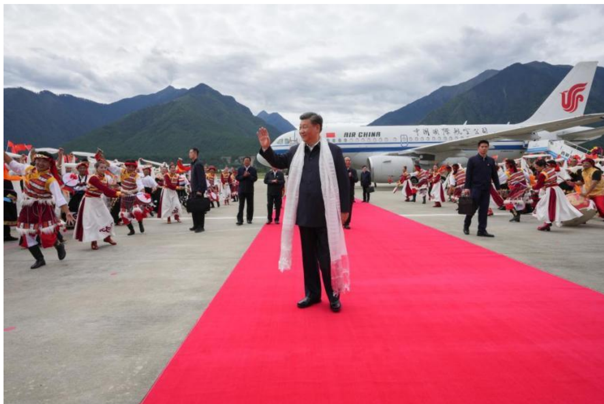
Chinese President Xi Jinping arrives at the Nyingchi Mainling Airport in Southwest China's Tibet Autonomous Region, July 21, 2021.

In an interesting admission, five months after claiming that it lost four of its soldiers in Galwan valley clashes, China has now revised the toll to five . 9 China has repeatedly been inconsistent regarding the death toll of the PLA in Galwan Valley clashes. In fact, after repeated denials, it is only in February this year China accepted that it suffered any casualties at all.