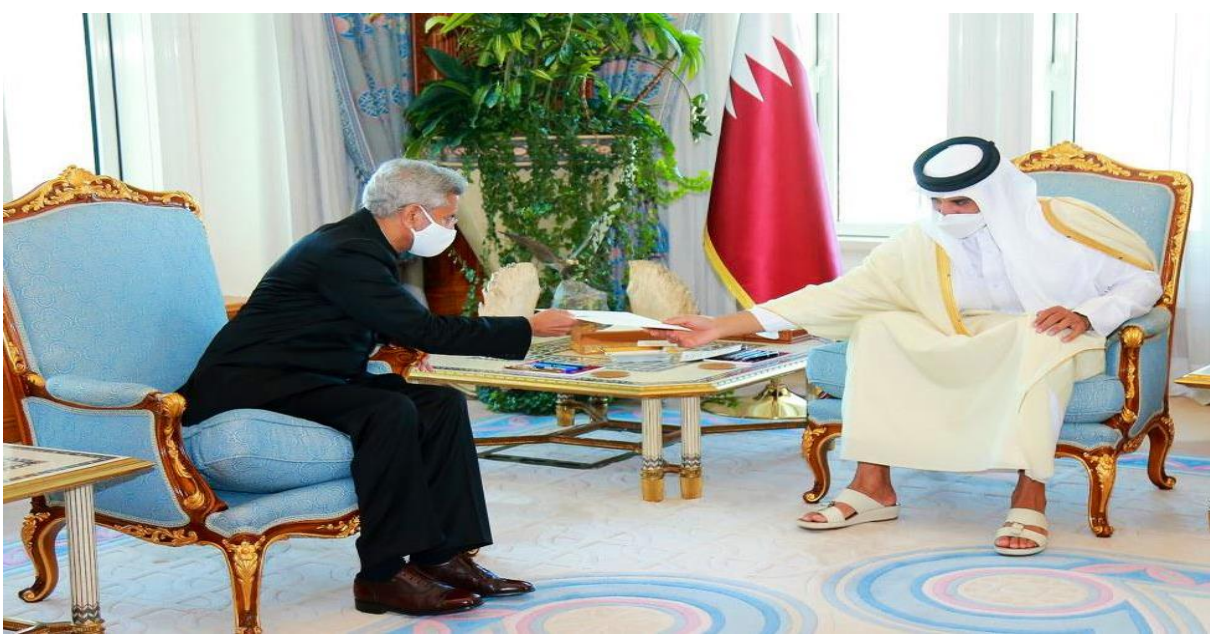
EAM Dr. S. Jaishankar hands over a personal communication from Prime Minister Narendra Modi to Amir of the State of Qatar, December 28, 2020.

Saudi Arabia, Bahrain, UAE, and Egypt restored relations with Qatar at the Al-Ula <u>Gulf Co-operation Council (GCC) Summit</u> held on January 5.<sup>101</sup> These countries had severed diplomatic ties with Qatar in June 2017 and had imposed a blockade. India welcomed the development and expressed the hope that this would give a "boost to peace and stability in the region".<sup>102</sup>