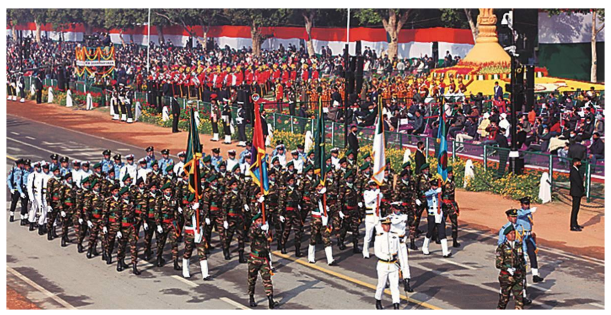
The Bangladesh contingent at India's Republic Day Parade, January 26, 2021.

dialogue, the <u>police chiefs</u> of both countries "reiterated the need for sharing of real time intelligence and feedback through the designated 'nodal points', while appreciating each other's ongoing action against insurgent groups operating in the region".<sup>48</sup>