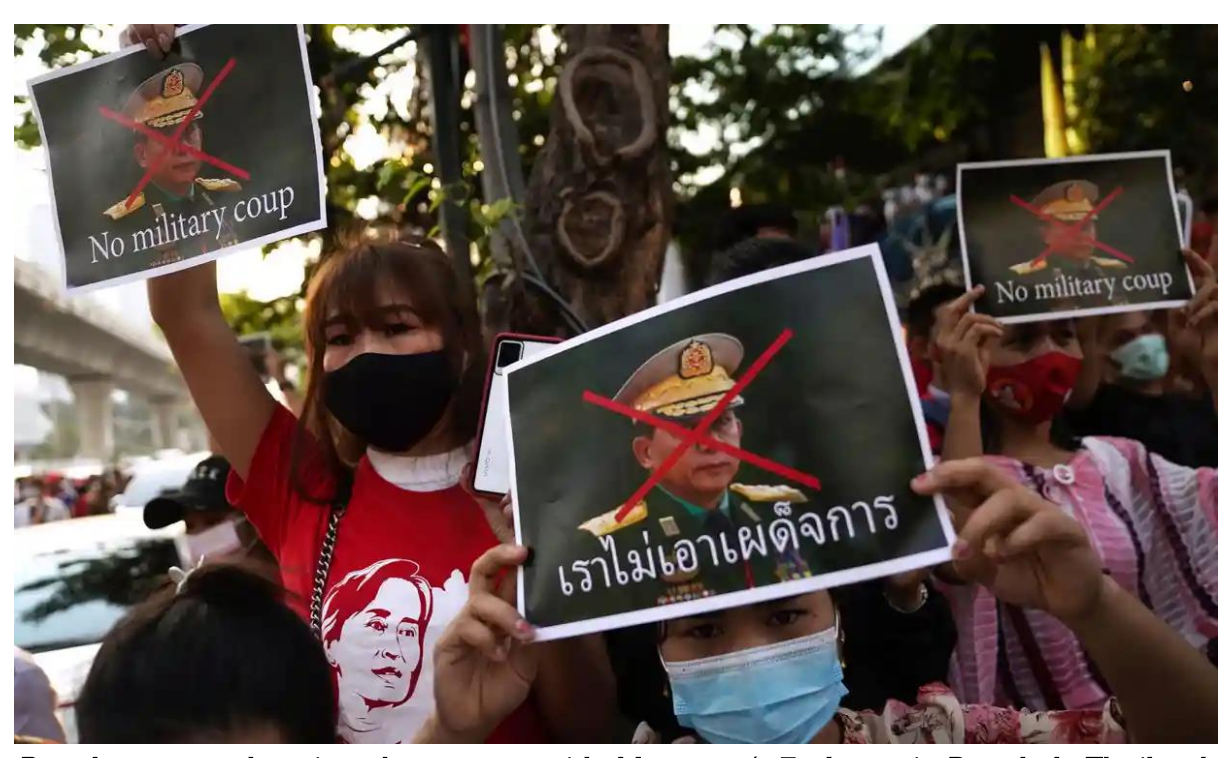
People protested against the coup outside Myanmar's Embassy in Bangkok, Thailand.

has alleged that the recently concluded elections were rigged. It had earlier <u>cautioned</u> that it would "take actions" if the government fails to address complaints regarding voter fraud.<sup>54</sup> The Suu Kyi-led National League for Democracy (NLD) had secured an <u>overwhelming majority</u> in the November 2020 elections while the military-backed Union Solidarity and Development Party (USDP) had won just over 6 per cent of seats.<sup>55</sup> International observers have <u>condemned the coup</u> and US President Joe Biden has "threatened to reimpose sanctions".<sup>56</sup> The Indian MEA said that it was <u>monitoring the situation</u> closely and has urged on the need to uphold the democratic process.<sup>57</sup> Several countries including Australia, Britain, Canada and the United States have <u>issued statements</u> urging the military "to adhere to democratic norms".<sup>58</sup>