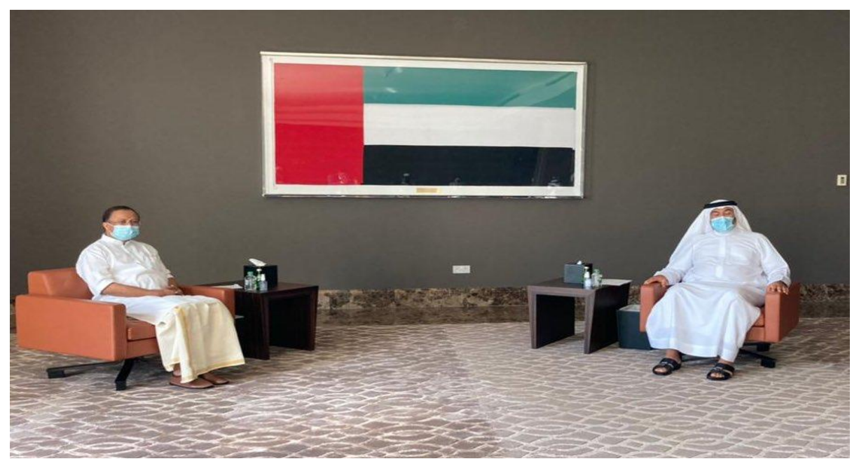
India's Minister of State for External Affairs, V. Muraleedharan meets UAE's Minister of State Ahmed Ali Al Sayegh in Abu Dhabi, January 20. 2021.

The Indian Oil Corporation bought its first consignment of Iraq's newly introduced <u>Basra Medium crude grade</u>. However, in a move to meet its <u>obligations under the OPEC+ agreement</u>, Iraq has reduced supplies of Basra crude to Indian refineries by up to 20 per cent, in the coming year. 116