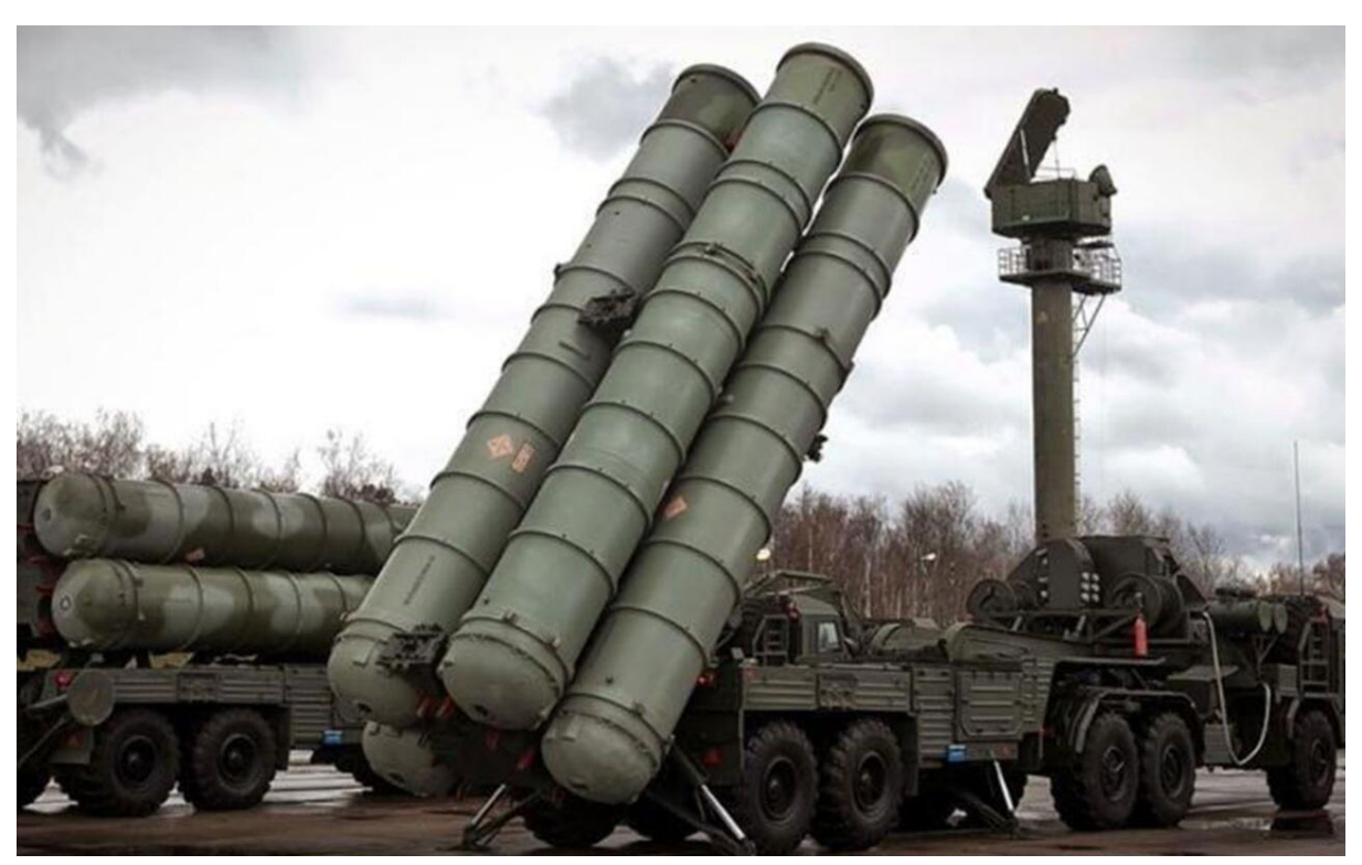
The Russian S-400 missile defence system.

India-Russia defence ties have continued to maintain positive momentum. Ignoring US warnings of sanctions under CAATSA (Countering America's Adversaries through Sanctions Act), India has put together a team of military personnel to travel to Russia and undergo operational training programmes on the S-400 missile systems for which India had finalised a USD 5 billion deal in 2018. So far, Turkey and China have both faced sanctions for procuring S-400 missile systems from Russia.