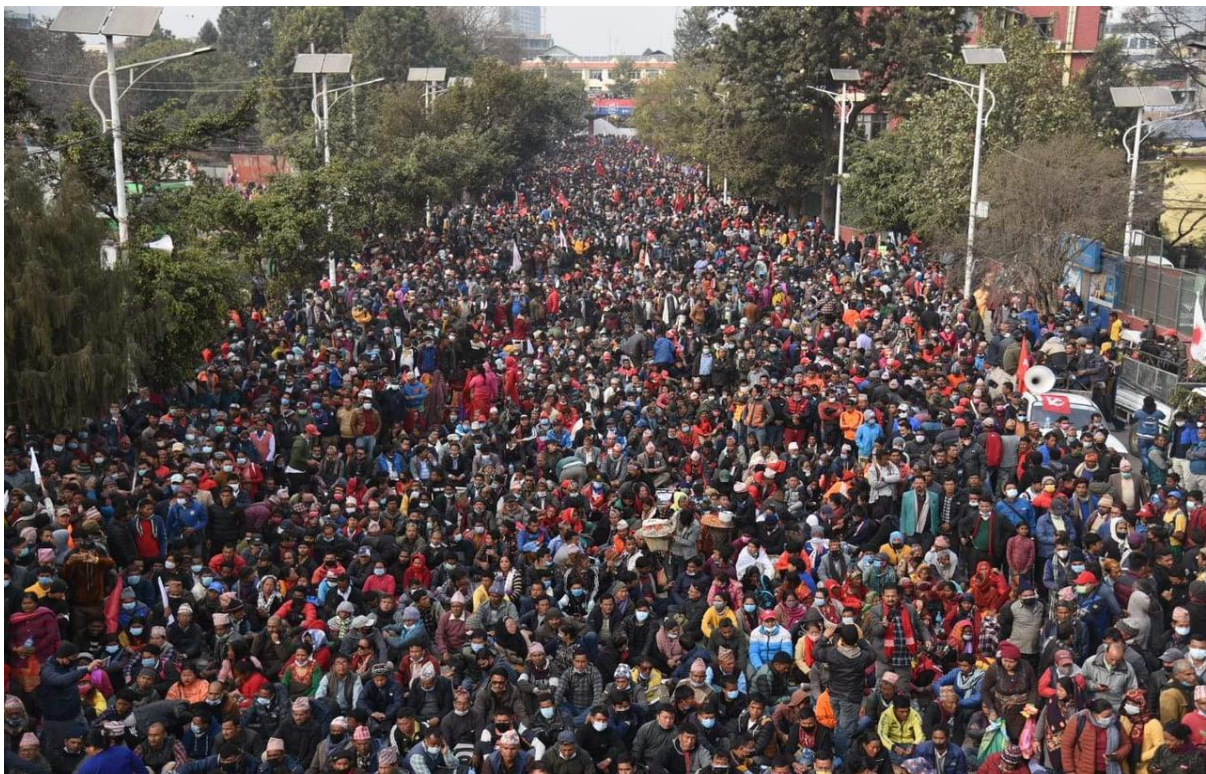
The Dahal-Nepal faction organised a mass rally on February 10 in Kathmandu to protest against KP Oli's decision to dissolve the House of Representatives.

Nepal was among the first countries to receive one million doses of the COVID-19 vaccines in January 2021 as a grant from India. 57 In February, Kathmandu purchased another one million doses from India and, on February 18, approved the emergency use of China's Sinopharm vaccine. 58 Nepal plans to eventually vaccinate at least 72 per cent of its 30 million population. 59