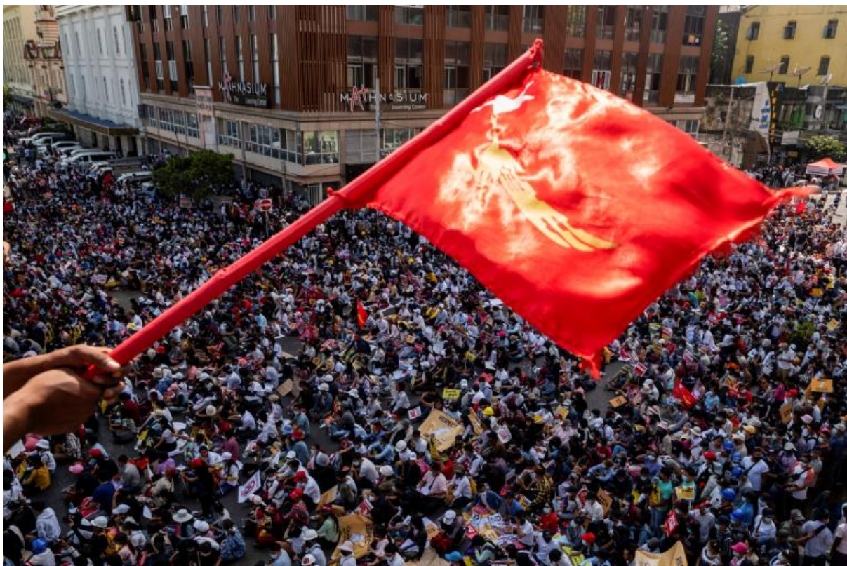
Protesters have blocked major roads in Yangon as thousands turn out every day in a show of public anger against the military coup.

The political fallout and the growing contestation between democracy activists and the military in Myanmar will have long-term consequences for the security situation along India's eastern borders. Unlike Myanmar, the current political crisis in Nepal has thus far been about who has legitimacy to govern through democratic institutional frameworks. Nonetheless, sustained fragility is neither good for Nepal nor its neighbours. Despite few setbacks, India's relations with Sri Lanka, Bangladesh and the Maldives continue to grow.