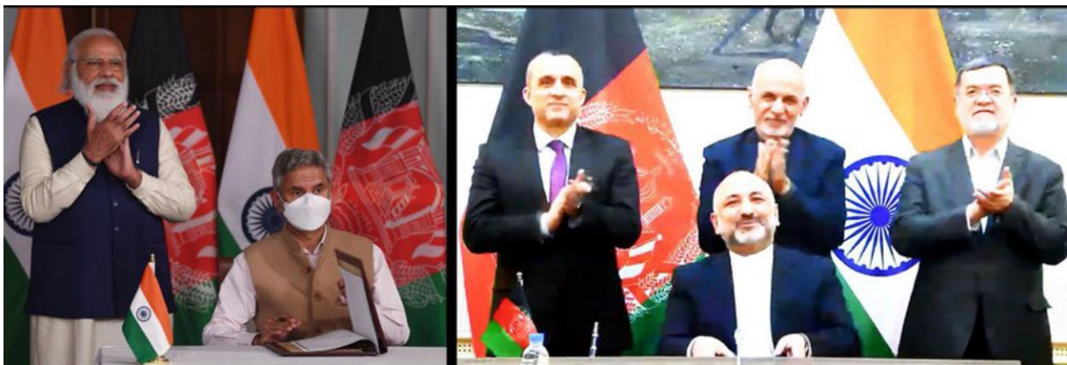
Virtual signing ceremony of the MoU between India and Afghanistan for the construction of Shahtoot Dam in Afghanistan, February 9, 2021.

On February 9, India and Afghanistan signed a Memorandum of Understanding for the construction of the Lalandar [Shahtoot] Dam to fulfil the safe drinking water needs of Kabul City, provide irrigation water to nearby areas, and to provide electricity to the region. 120