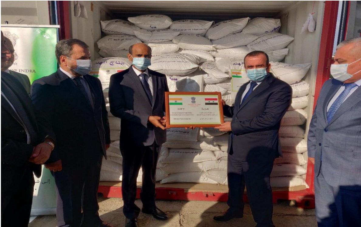
India's humanitarian assistance of 2000 MT rice as gift for people of Syria arrives in Latakia, February 11, 2021.