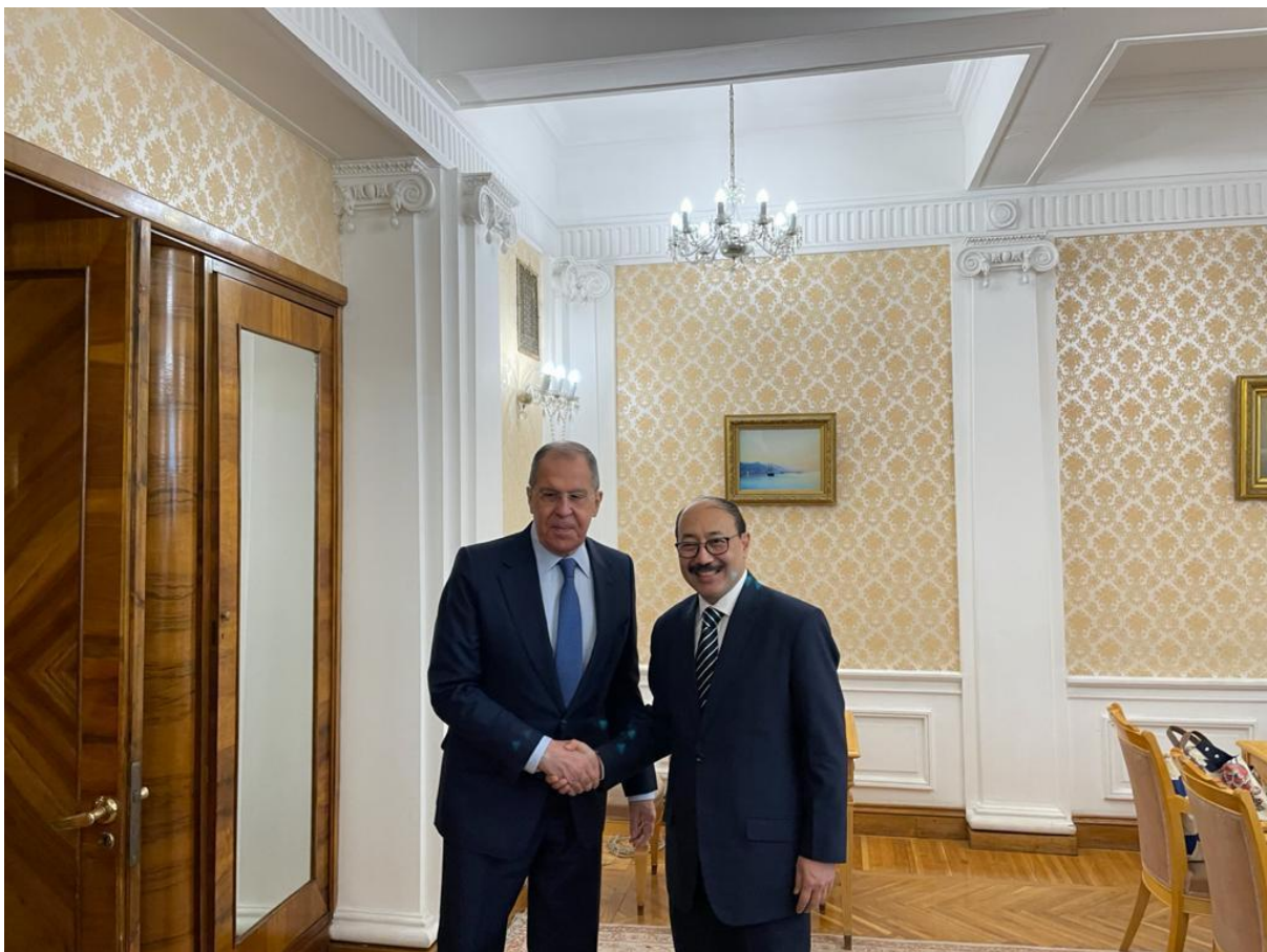
Indian Foreign Secretary Harsh Vardhan Shringla called on Russian Foreign Minister Sergei Lavrov in Moscow on February 17, 2021.

India's Foreign Secretary (FS) Harsh Vardhan Shringla travelled to Moscow on February 16-18 for a series of bilateral meetings with high level officials from the Russian Foreign Ministry, including Foreign Minister Sergei Lavrov and Deputy Minister of Foreign Affairs Igor Mogulov. 190 During the visit, the FS discussed a wide range of issues such as enhanced India-Russia co-ordination on various international platforms, closer co-operation on counter-terrorism, strengthening business/economic linkages with specific reference to liquefied natural gas (LNG), coking coal for Indian steel sector, and new technologies. 191 The FS also delivered a lecture at the Russia Academy of Diplomacy and interacted with members from academia. A week earlier, the Russian Embassy in New Delhi had announced that India and Russia have finalised an 'air bubble' agreement , which came into effect on February 12, and will allow certain international passenger flights to enter the territories of the two countries. 192