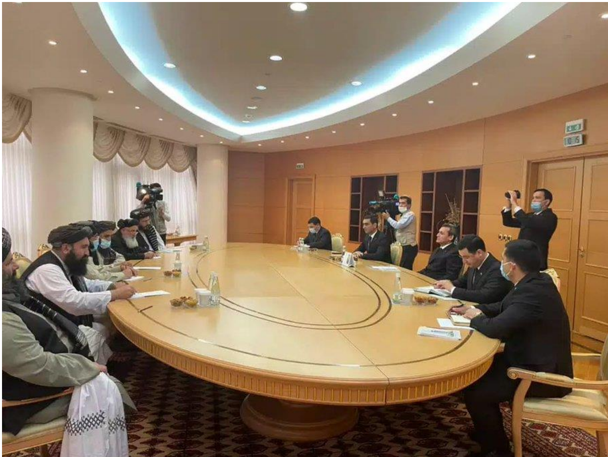
Taliban deputy leader, Mullah Baradar in discussion with the Deputy Prime Minister and Foreign Minister of Turkmenistan in Ashgabat, February 6, 2021.

optic communication system among others. 112 It is hard to believe that the Taliban will stick to its pledges as it prepares to launch another spring offensive . 113