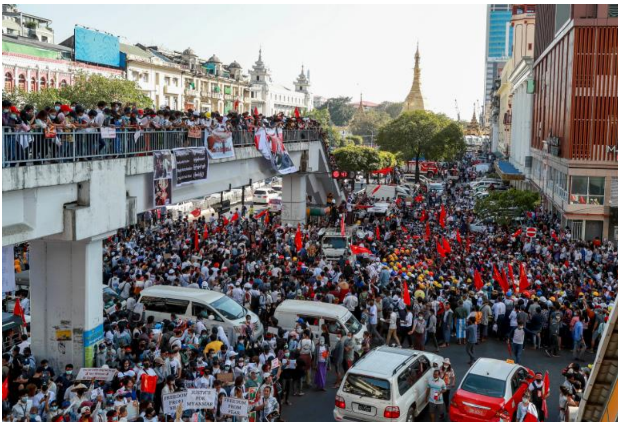
Demonstrators wave the NLD flag during a protest in Yangon against the coup.

India’s development interests in Myanmar may also take a hit because of the coup. On February 15, EAM Dr. S. Jaishankar said that the Kaladan Multi-Modal Transit Transport Project was in the “final stages” and hoped that India’s other development projects are not affected. 105