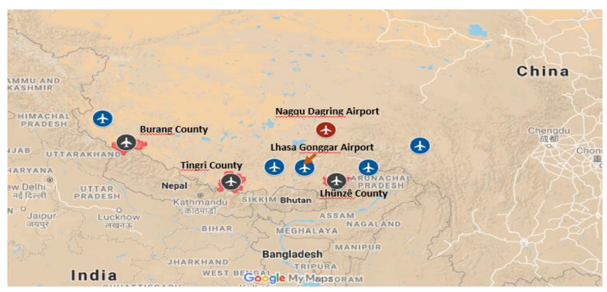
The proposed three new airports (in black).

The PLA is upgrading one of the civil airports in Gonggar in Tibet. It is also planning to build three new airports at Burang, Lhunze and Tingri in southern Tibet under '3+1 project' at a total cost of $2.6 billion, which is due to be completed by 2021.