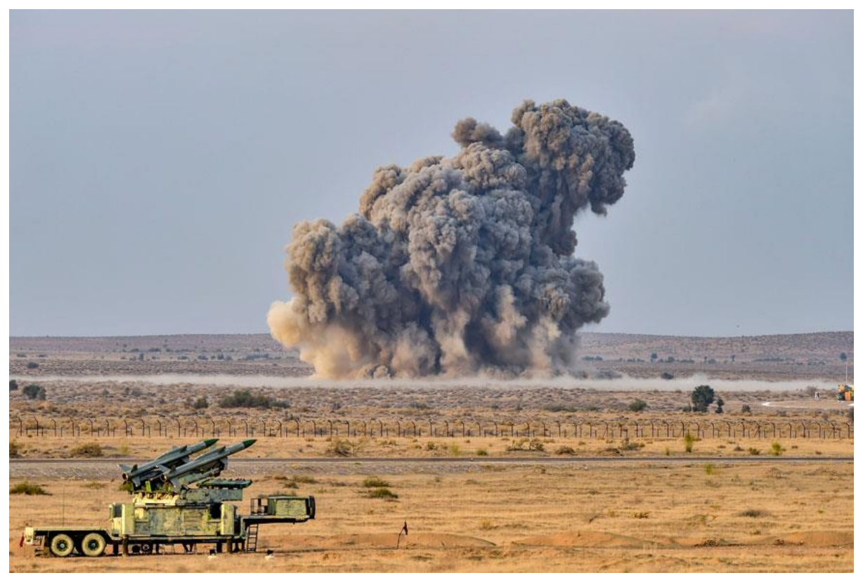
Indian Air Force demonstrates its combat and firepower during 'Vayu Shakti 2019' at Pokhran, Rajasthan.

INS Trikand participated in the Exercise 'Cutlass Express-19' organised by U.S. Africa Command (USAFRICOM), and conducted by Naval Forces Africa (NAVAF), off the coasts of Djibouti, Mozambique and the Seychelles, from January 27-February 6, 2019. The objective of the exercise was to improve maritime law enforcement capacity, promote national and regional security cooperation in Eastern Africa, and shape security force assistance (SFA) efforts<sup>3</sup>.