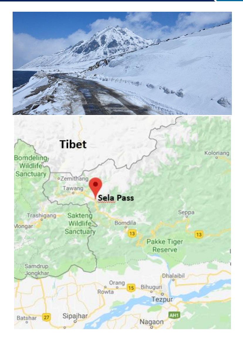
Sela Pass.

A Border Roads Organisation (BRO) Report indicates that 61 strategic roads, covering a total length of 4634 Km, are being constructed along India-China border. Significant among these are: a 35 Km road to the site of 2017 Doklam standoff in East Sikkim (likely to be completed this year) and a road connecting Leh-Darbuk to Daulat Beg Oldie (by 2020).