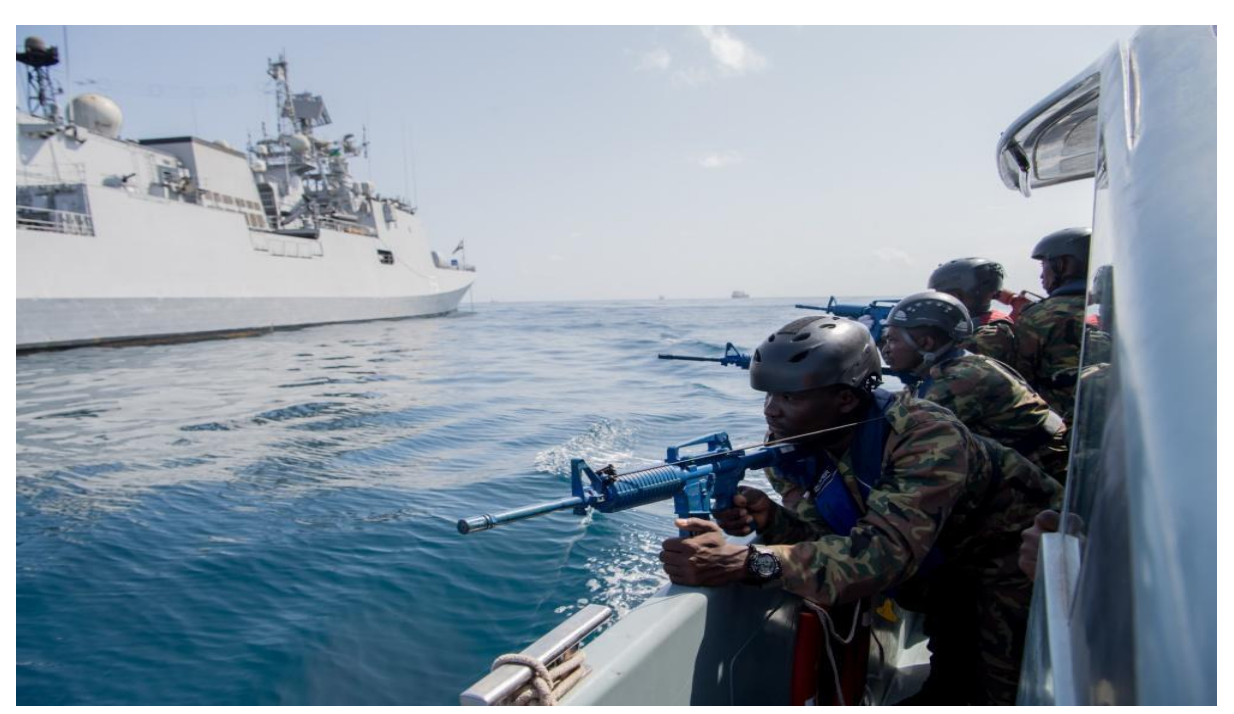
Comoros sailors prepare to participate in visit, board, search and seizure training aboard the Indian Talwar-class frigate INS Trikand (F 51) during exercise Cutlass Express 2019 in Djibouti, Feb. 4, 2019.