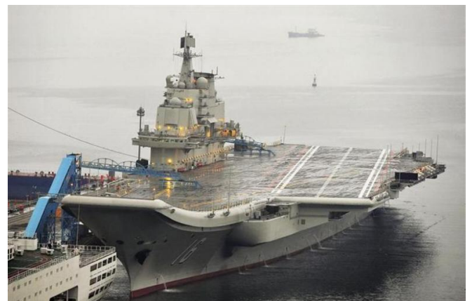
China's first aircraft carrier, which was refurbished from an old aircraft carrier that China bought from Ukraine in 1998, docked at Dalian Port, in Dalian, Liaoning province September 22, 2012.