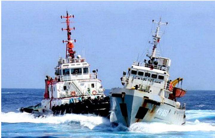
JUNE 2014 CLASHES - Chinese and Vietnamese-owned vessels clashed on June 23, near a Chinese oil rig that had been set up in a part of the South China Sea that is being claimed by both countries.

Since the normalization of relations in 1991, bilateral relations between Vietnam and China have developed into one of normal or mature asymmetry. This is a relationship in which China seeks acknowledgement of its primacy and Vietnam seeks recognition of its autonomy.