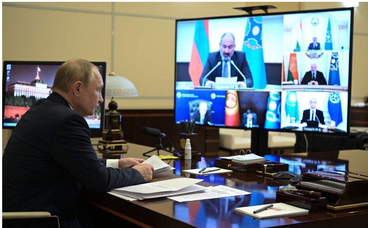
Russian President Vladimir Putin attending a virtual emergency meeting of the Council of the Collective Security Treaty Organization (CSTO) at the Novo-Ogaryovo state residence, January 10, 2022.

instigated by 'international terrorists' to undermine the country's territorial integrity.