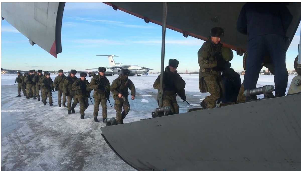
Russian-led CSTO troops begin withdrawing from Kazakhstan after their peacekeeping operation, January 13, 2022.

Diplomatically, Kazakhstan is bound with Russia by numerous multilateral treaties, such as the CIS, CSRO, and Eurasian Economic Union (EAEU), ensuring that it remains steadfastly within Moscow's orbit.