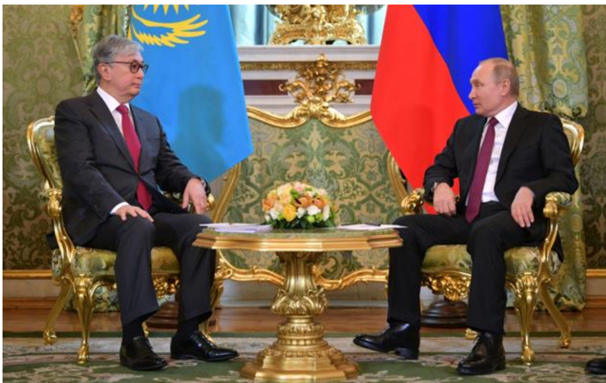
Russian President Putin meeting Kazakh President Kassym-Jomart Tokayev at the Kremlin, April 3, 2019.

The reality is that a new generation of Central Asians has grown up in a much more Islam-infused environment since the Soviet collapse. Mosques have been built and renovated all over the region with the funding coming from the Arab countries and from Turkey. Wearing of the hijab and burka by women has long become a symbol of an increasing Islamic influence, despite legislation being passed in Tajikistan requiring people to “stick to traditional clothes and culture”. 13 People offering mass prayers in the open air had become a practice in Kyrgyzstan a decade ago. This time the protesters in Almaty were seen conducting mass prayers in the open air.