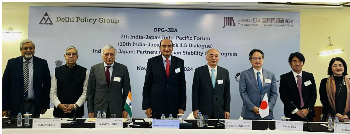
7th DPG-JIIA Indo-Pacific Forum, Public Session, November 19, 2024.

In the October-December 2024 quarter, DPG launched a new series of periodic roundtable discussions on India's emerging foreign and security policy horizons. The first in this roundtable series (October 10) focused on India's strategic and neighbourhood challenges across the board. The second iteration (December 4) reviewed the outlook for India's relations with the great powers and the imperative of military modernisation.